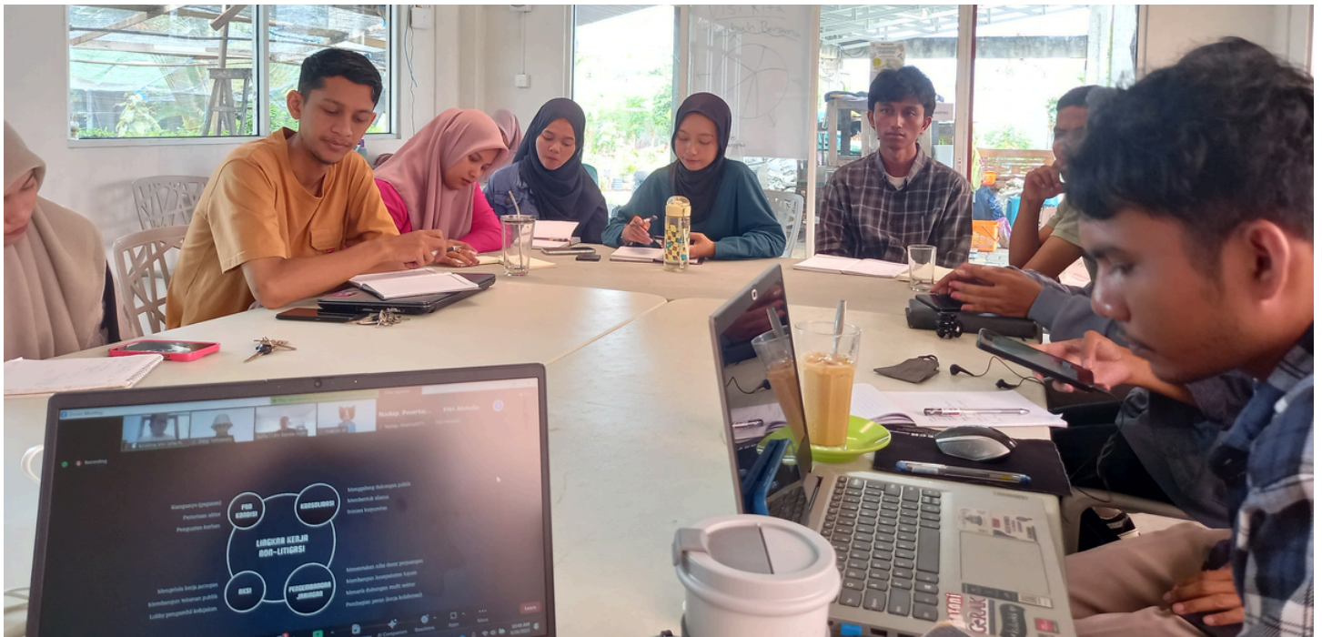
Photos from the Event in class

The direct beneficiaries amounted to 317 persons, consisting of 17 internship program participants, 9 Flower Aceh personnel who were directly involved in the program management, 13 persons from the partner organizations involved in mentoring and internship program activities, 17 persons as resource persons for in-class activities and thematic discussions, 8 facilitators, and discussion participants as many as 253 persons.